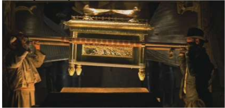
Another claim is that it's in a cave under Golgotha, where Jesus was crucified, and when Jesus bleed while on the cross the blood dropped on the ground and went into a crack that went into the cave. Jesus' blood then fell onto the Ark.

It has been shown in the movies, Indiana Jones, that it was in the Egyptian town of Tunis and later put into a government warehouse.